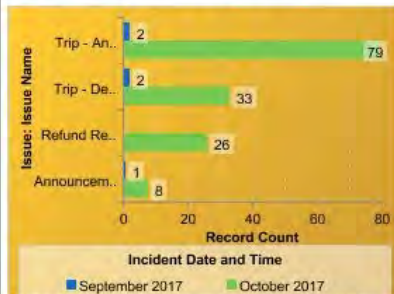
Graph depicts # of issues generated by Top 5 Trains this month vs. last month.